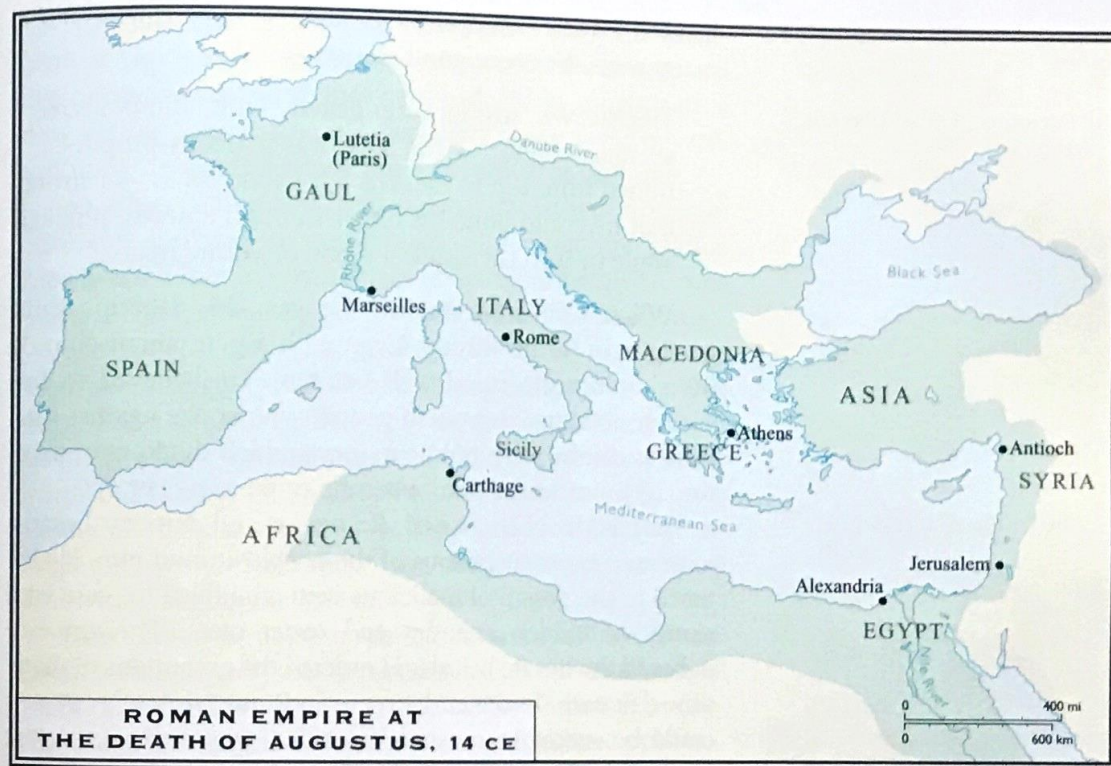
ROMAN EMPIRE AT THE DEATH OF AUGUSTUS, 14 CE

He often had terrible stomach pains, he sometimes laughed uncontrollably, and he got a runny nose when he was angry. His physical problems, combined with his tendency to daydream, convinced Augustus that Claudius would not make a good emperor. Augustus and Tiberius talked about it and agreed not to give the young man any official duties. They decided that he should never take part in public ceremonies—he might embarrass the family.