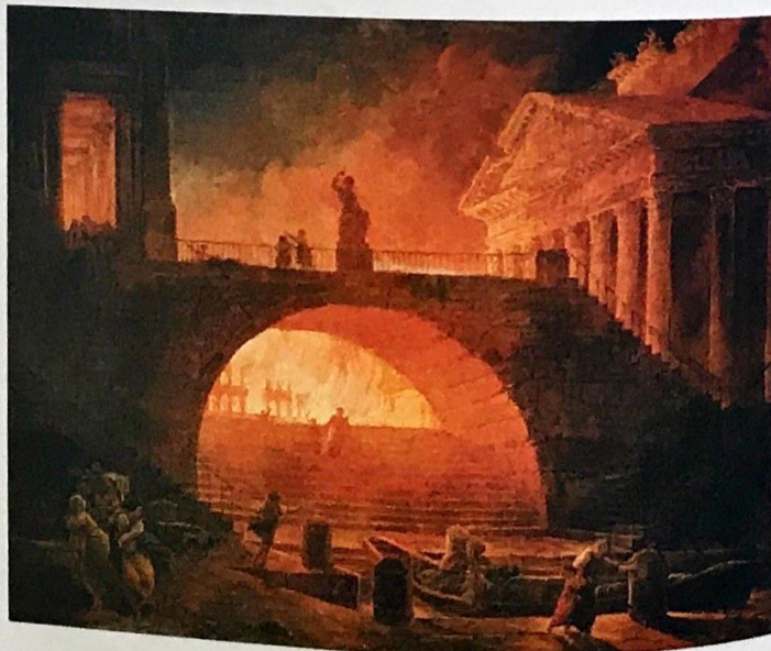
Rome is burning in this 18th-century French painting. Many people thought that Nero started the fire so that he could build a new palace.

Civil war returned to Rome after Nero’s suicide. One general after another marched on the capital city. In 69 CE, it seemed that anyone with an army could become the