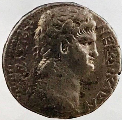
This coin shows Nero looking pudgy, self-centered, and self-satisfied. He had already lost the image of the promising young emperor who would do great things for Rome.

“Palace” comes from the Latin word palatium , since the emperors lived in the imperial mansion on the Palatine Hill in Rome.