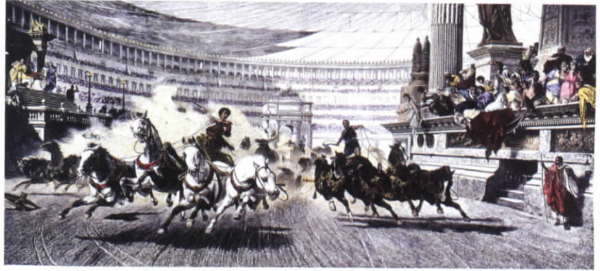
At the Circus Maximus, dangerous chariot races thrilled thousands of spectators.

Men and women sat in separate sections at the Colosseum, but at the Circus Maximus they could sit together. A Roman poet said the Circus Maximus was the best place to meet a new boyfriend or girlfriend because you never knew who would sit next to you.