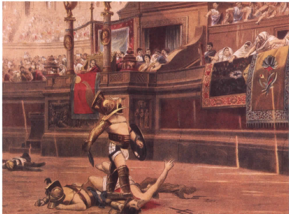
Rome's gladiator games were bloody—and deadly.