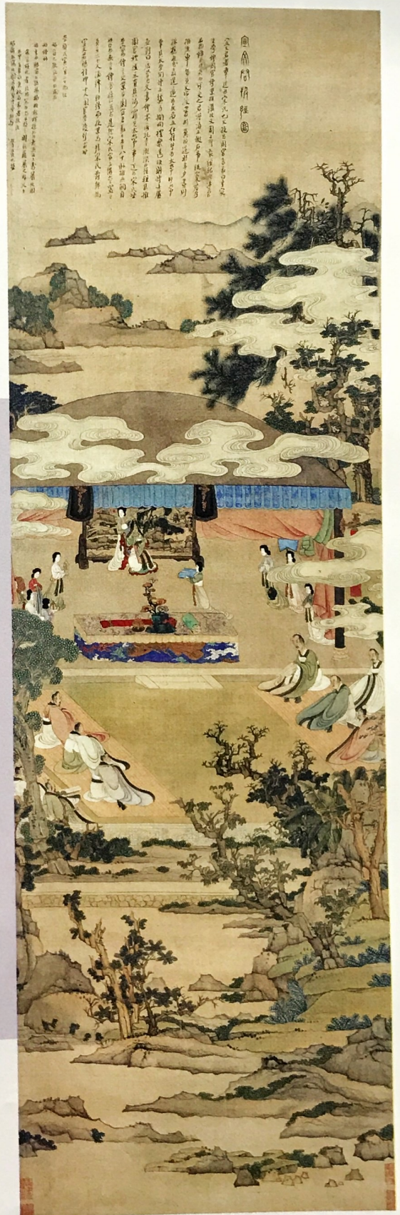
This silk scroll shows women instructing other women in the teachings of Confucianism.

In the next chapter, you will meet China's first emperor, Qin Shihuangdi. You'll discover how he used Legalist ideas to unite China's warring states.