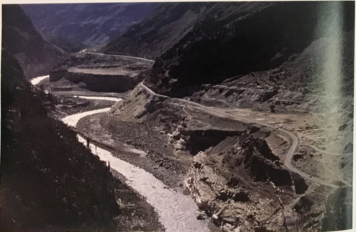
The Karakoram Highway connects northern Pakistan with China.

The empire's roads greatly benefited trade. They allowed traders to move easily from city to city within the empire. Traders could also move goods from the middle of the country to important waterways. From there, the goods could be shipped and sold to other countries. The roads also connected India to China and the lands east of the Mediterranean Sea.